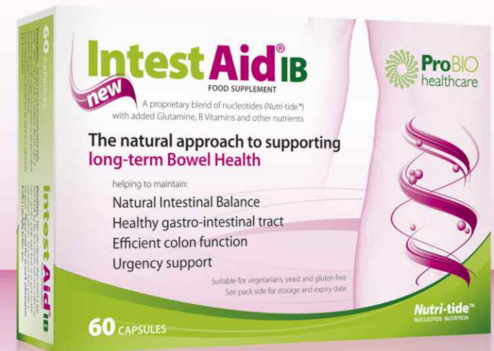
IntestAid®IB 60 capsule pack – one months supply

from April 2009 to March 2010 a £2 million nationwide PR and advertising campaign in the press, journals, magazines and radio campaigns.